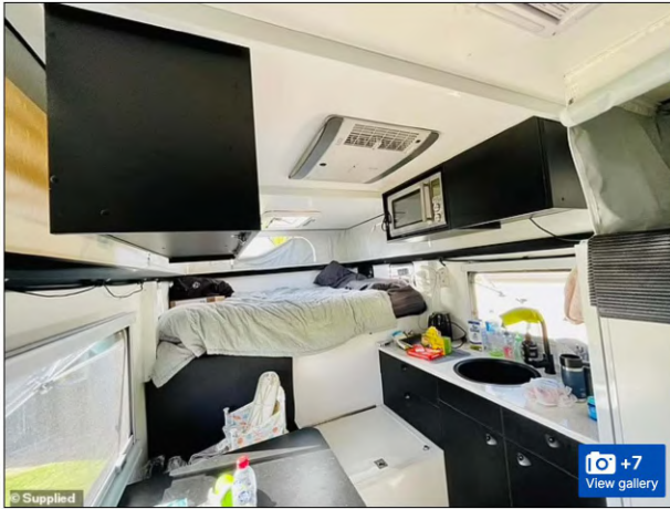
Inside the tightly packed caravan had everything the family needed - bunk beds, a tiny kitchen, bathroom, fridge, microwave and Wi-Fi

The couple only planned to travel for 12 months but Ryan was made redundant at Christmas so they kept exploring for another four months