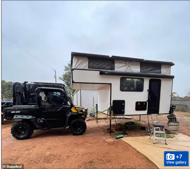
The truck also towed a trailer with a buggy on it. Along the way Ryan picked up farm work and in one month made an eyewatering $22,000

The couple only planned to travel for 12 months but Ryan was made redundant at Christmas so they kept exploring for another four months.