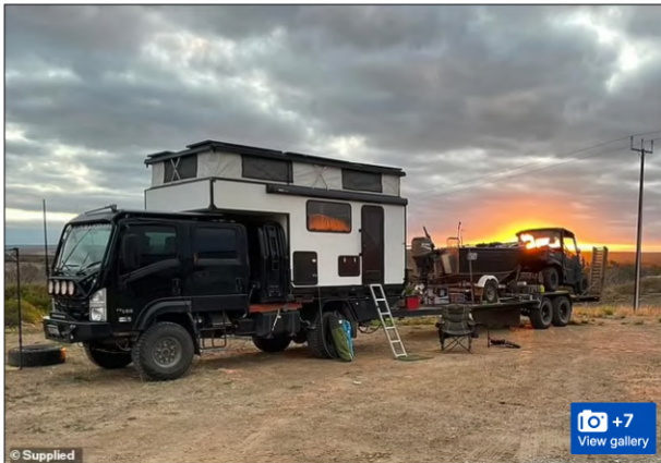
On average the couple spent $1500 weekly, with fuel being their biggest cost followed by groceries