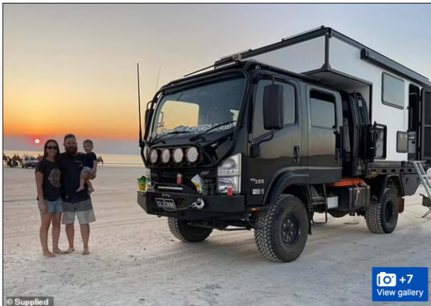
Now the family have returned home and are planning their next adventure - though this time they'll sell their house to fund the trip

Now the family have returned home and are planning their next adventure - though this time they'll sell their house to fund the trip.